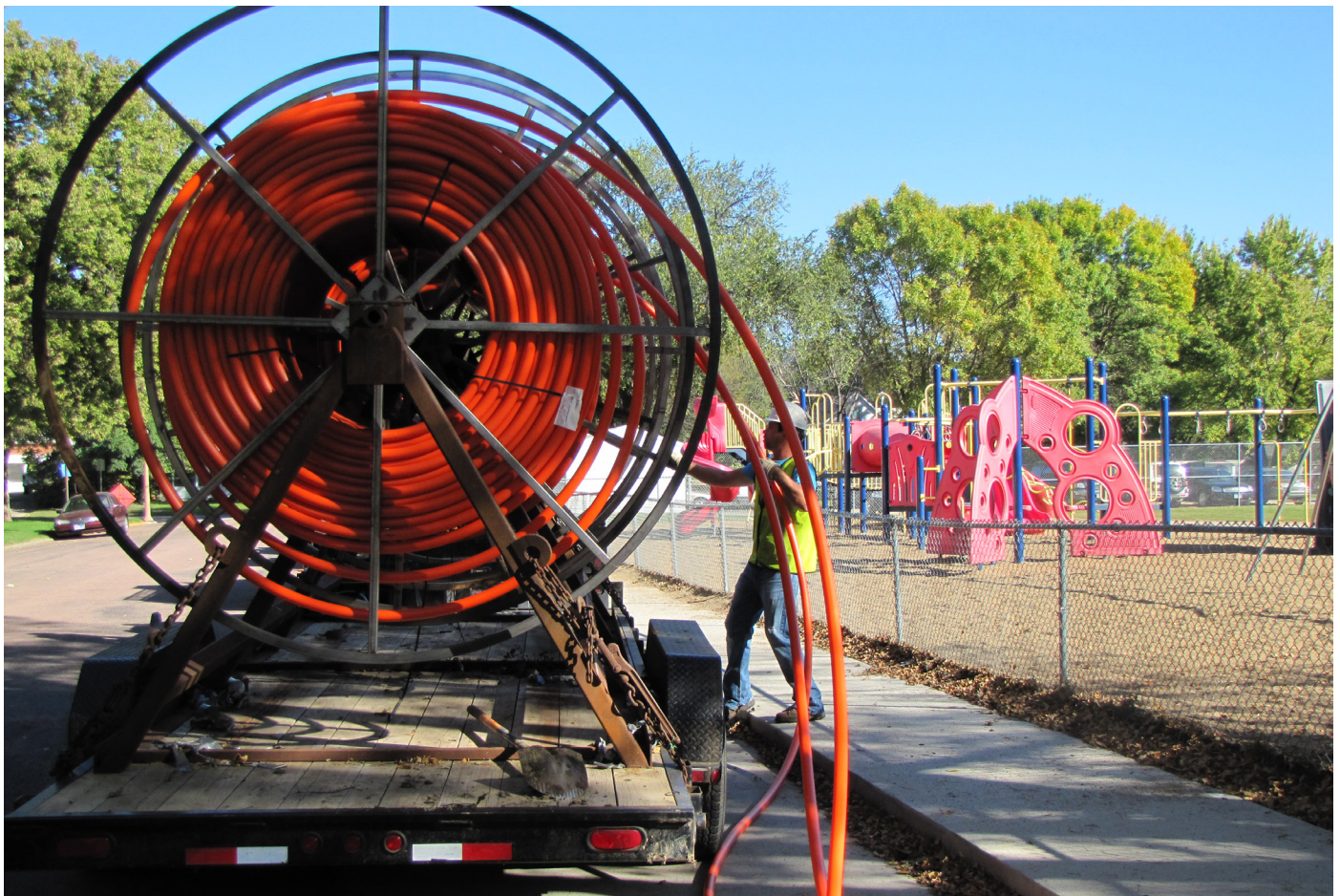
South Dakota Network crews deployed a fiber network to connect local anchor institutions — schools, hospitals, public safety agencies and government offices.

✦ Support from Community Forces: CAIs, non-profit groups, research, education and government networks can drive initial demand and promote capacity building over the long-run.